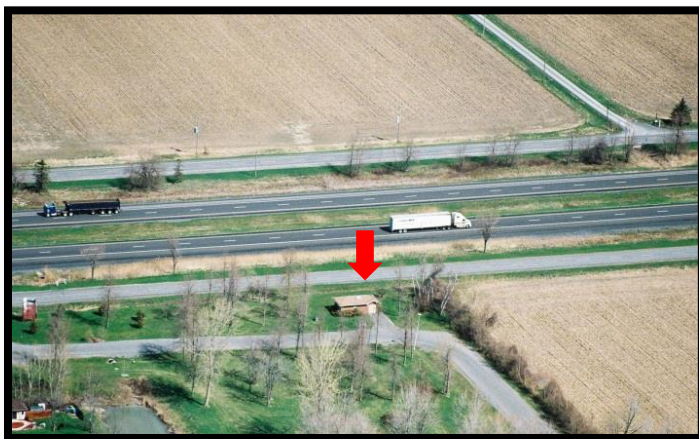
The Redwood Estates Wellhead in South Glengarry

This drinking water system is one of 13 systems in the Raisin-South Nation Source Protection Region that use groundwater as a source of municipal drinking water. There are 13 other systems that use surface water (rivers and lakes).