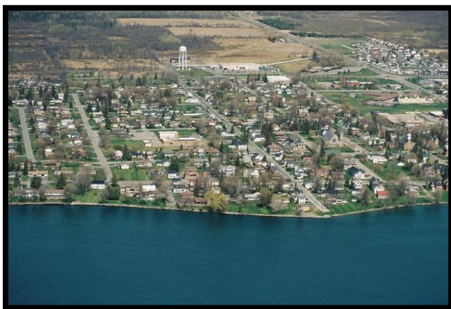
Morrisburg Intake (St. Lawrence River)

The Town of Morrisburg municipal intake is located at the south end of Augusta Street toward the west of the town limits, in the St. Lawrence River. Raw water is drawn from approximately 2.75 m off the river bottom. The normal depth of water over the intake is estimated to be 8 m. The South Dundas Regional Water Treatment Plant is owned by the Township of South Dundas and is operated by Caneau Water and Sewage Operations Inc. This municipal water system services the villages of Morrisburg and Iroquois respectively and provides drinking water to the approximately 3,938 residents of these two communities.