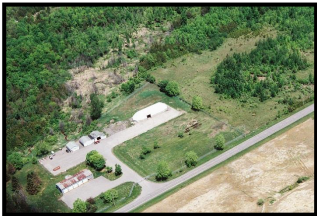
The Shadow Ridge Wellhead, Greely

The Shadow Ridge Subdivision is located in the Village of Greely. Greely is located within the municipal boundaries of the City of Ottawa but outside its area of service. Designed with private services, Shadow Ridge has a communal well supply consisting of 2 wells spaced about 10 m apart. The City of Ottawa is the operator for this drinking water system which currently serves a population of 435. Further development is planned which will expand the population being serviced by this system to 2,078 people.