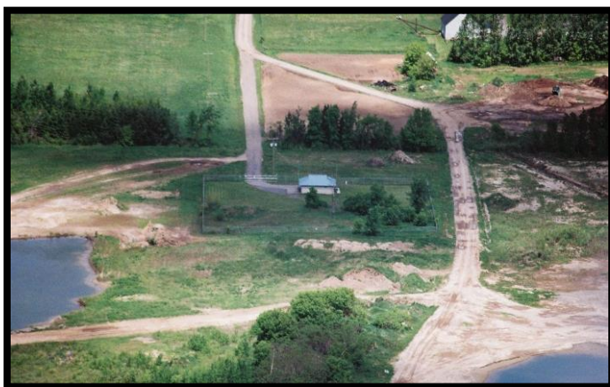
The Chrysler Water Treatment Plant

The village of Chrysler is located approximately 60 km southeast of Ottawa in the North Stormont Township. The Chrysler drinking water system is owned by the Township of North Stormont and operated by the Ontario Clean Water Agency (OCWA). The well field contains 2 wells and serves a population of approximately 600 residents.