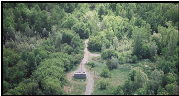
The Chesterville Drinking Water System

The municipal drinking water system for the village of Chesterville is comprised of one production well and one standby well. The wells are owned by the Township of North Dundas and are operated by the Ontario Clean Water Agency (OCWA). This system services a population of approximately 1,560 and is located approximately 3.8 km west of the village of Chesterville and 200 m north of Highway 43.